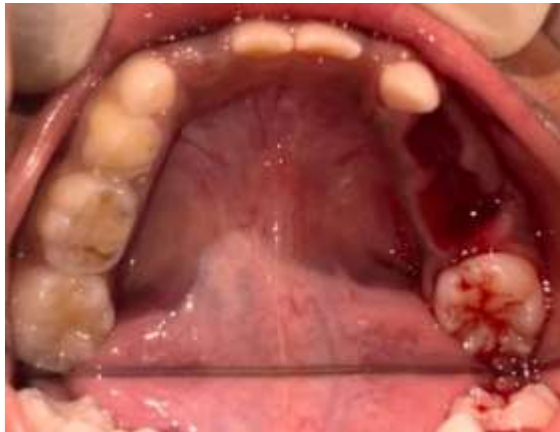
Immediate post extraction