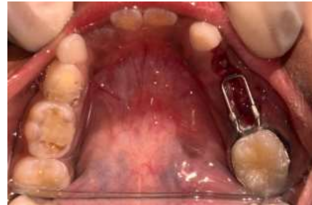
Mesial shoe space maintainer