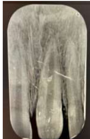
POST- OP XRAY