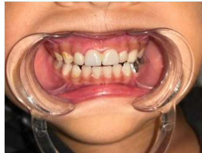
2 weeks follow up