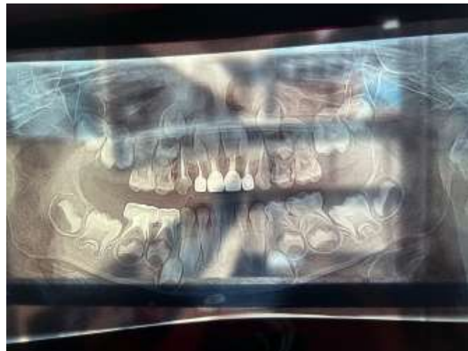
Post treatment opg