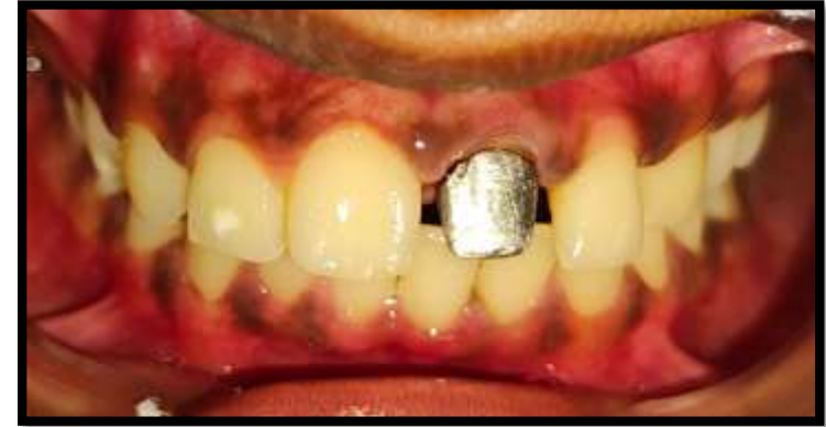
Fabrication of metal post