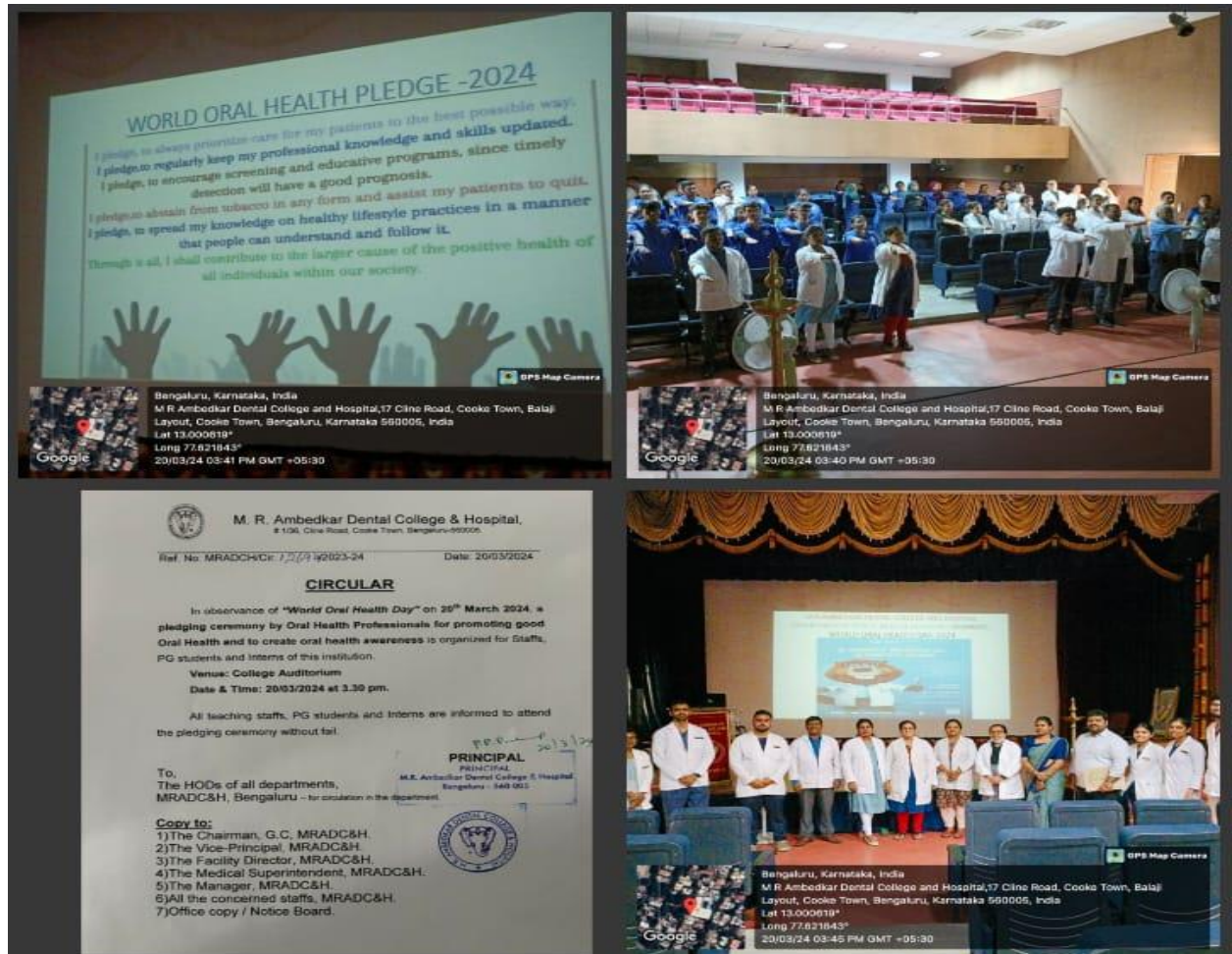
Pledging ceremony by oral health professionals.